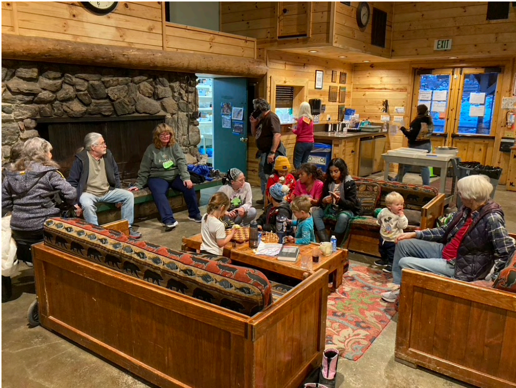
UUFSD Family Camp at deBenneville (see pages 8-10 for Camp deBenneville update)

Inspired by our UU principles, we are a vibrant, intentionally diverse congregation that models and promotes both locally and globally: love, spiritual growth, service, right relations, and sustainable living.