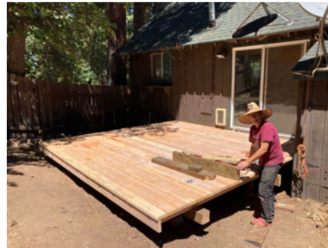
Building a new deck for the Maintenance Cabin