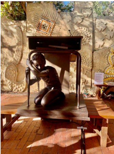
Statue of student hiding under a desk during a school shooting