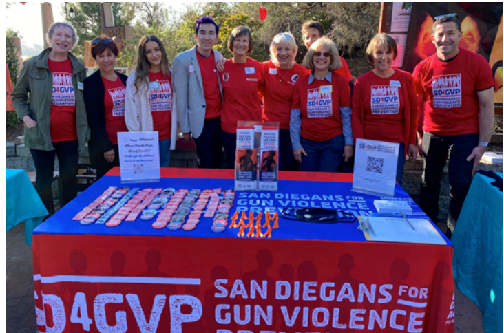
Members of the SD4GVP event crew