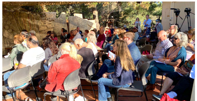
Partial attendance - standing room only