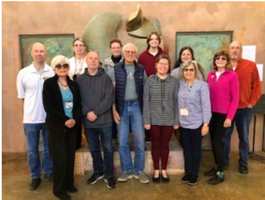
RE Committee and RE Teachers

Published by the Unitarian Universalist Fellowship of San Diego in order to promote love, growth, and right relations both locally and globally.