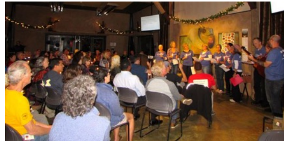
Peace and Freedom Singers