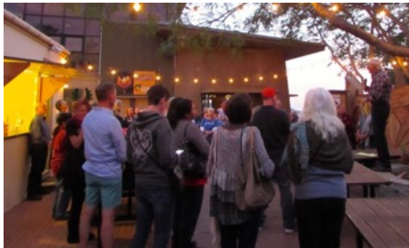
The Vigil Gathering