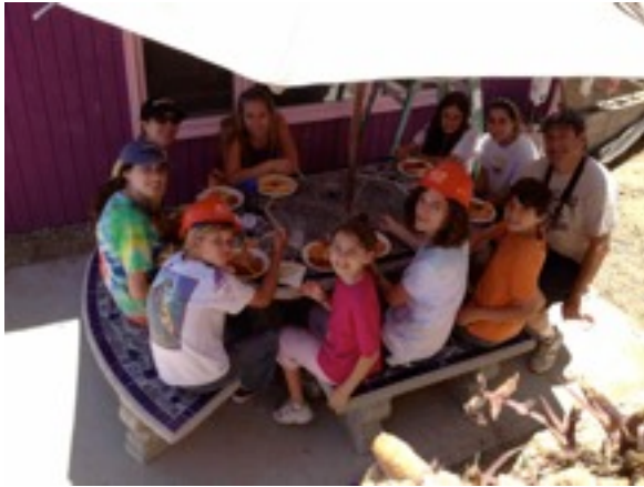
Children Builders at Lunch