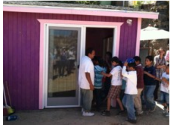
Welcome to the new Community Center